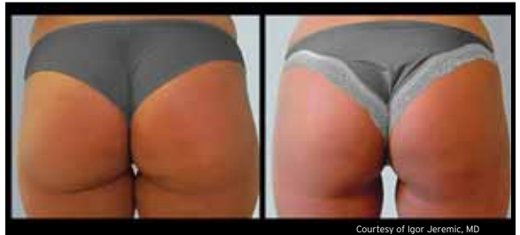
Before and after 6th treatment