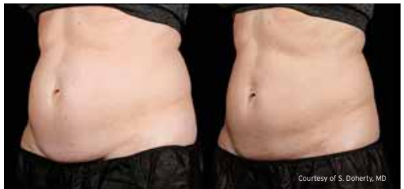
Before and after 6 weeks. 1 treatment, Flanks and Abdomen